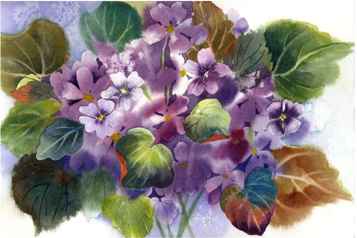
Violet Collage #14 by Shirley Nachtrieb