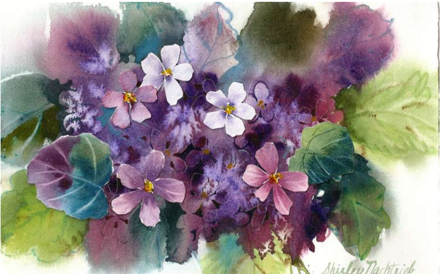
Violet Collage #13 by Shirley Nachtrieb