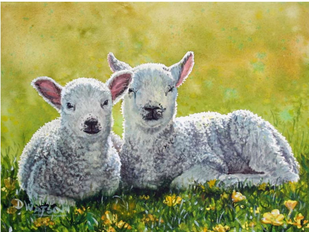
Buttercups by Debi Watson, from from the MOWS Summer Online Members' Show 2012

These paintings will be included in the MOWS Summer Online Members' Show - yours can be too!